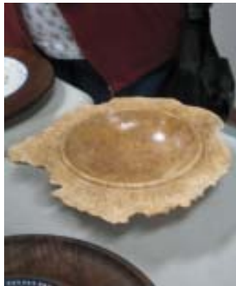
Maple burl bowl