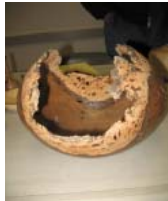
Bill's Cork Oak bowl