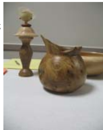
Natural edged Vessel