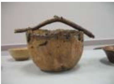
Maple burl bowl