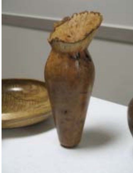
Burl hollow vessel