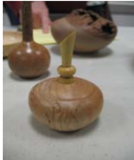
Rollie's snap-lid box