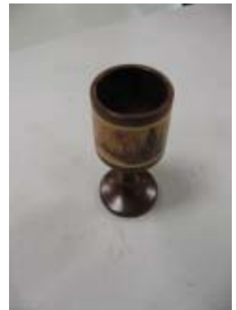
Marquetry on a chalice