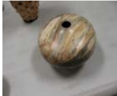
Alton Gay's spalted Buckeye hollow vessel