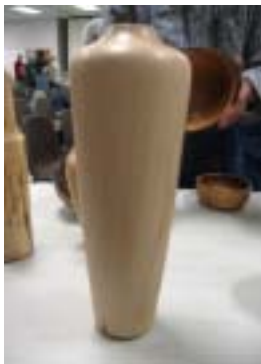
Glenn Robison's Oak vase