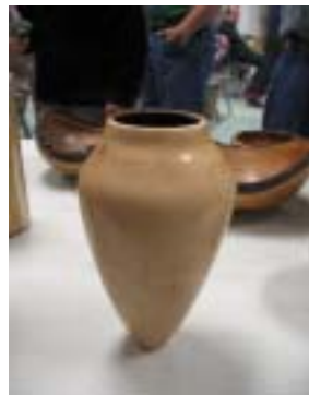
George Neal's tapered vessel