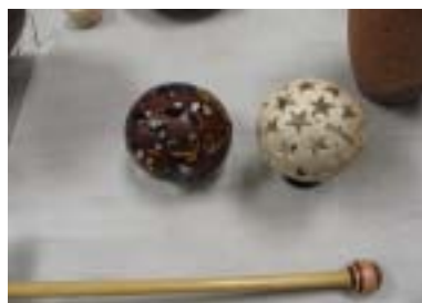
Rollie Bown's "star" hollow spheres