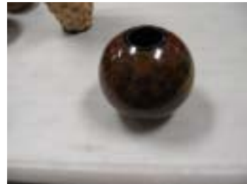
Bill Flewelling's colored Maple burl vessel