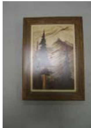
Marquetry in a Frame