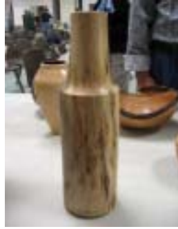
Glenn Robison's spalted Pine vessel