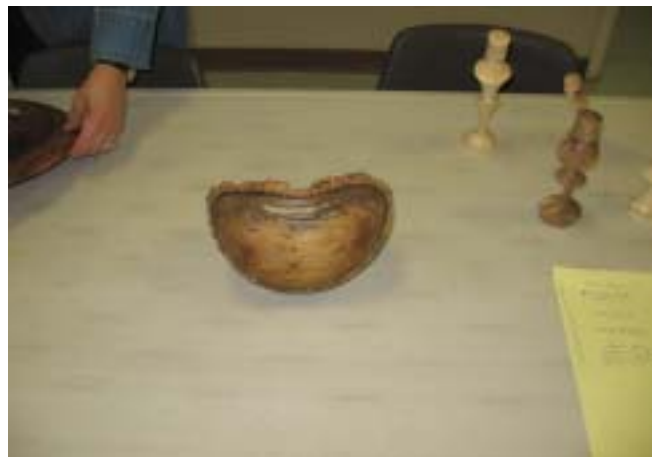
Bill Flewelling's Cork Oak bowl