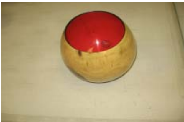
Herb Medsger's Chinese Tallow vessel