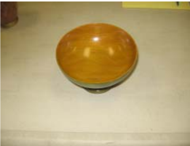
Herb Medsger's colored Sycamore bowl