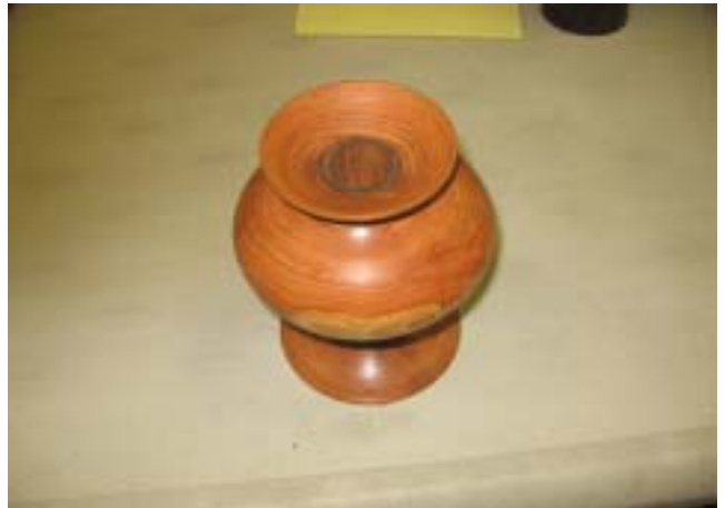
Dan Clark's Aspen vase