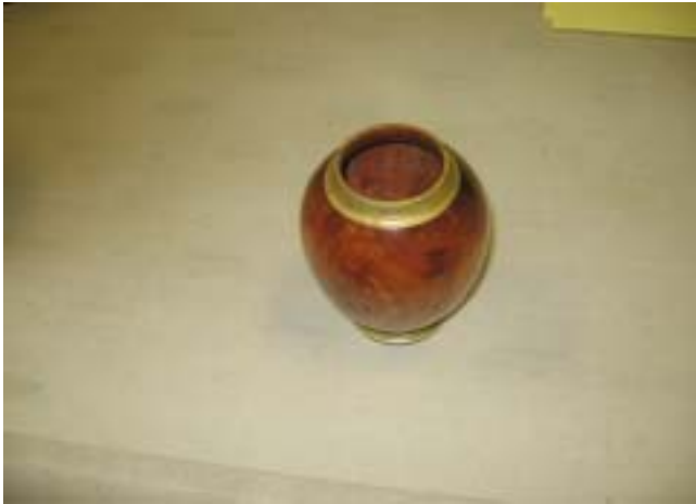
Herb Medsger's Plum vessel