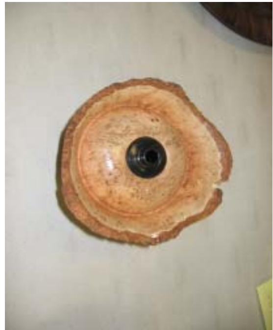
Phil Sargent's Sycamore vase