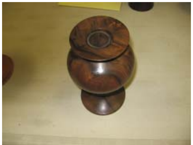
Dan Clark's Walnut vase