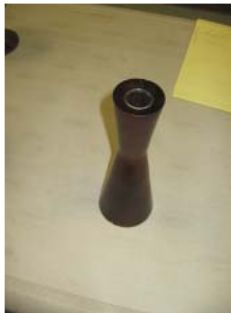
Dan Clark's Mahogany vase