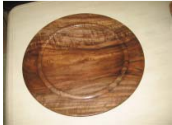
Phil Sargent's Walnut platter