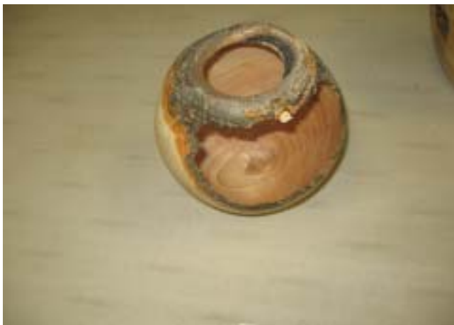
Bill Flewelling's hollow vessel (unidentified wood)

Your editor joins the Nor-Cal Woodturners board in welcoming new members: