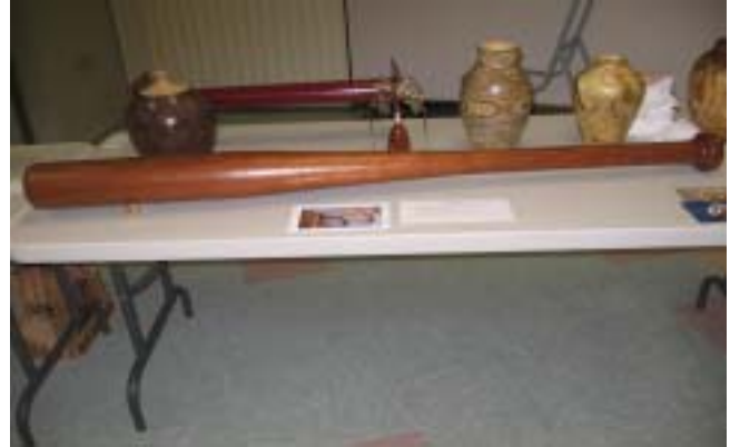
Rollie Bowns' 'Big Boy' Redwood bat.