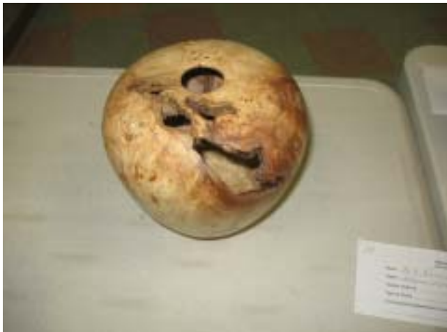
Bill Flewelling's hollow vessel (unidentified wood)