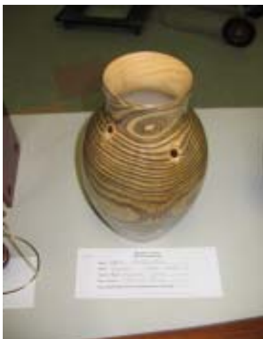
Herb Medsger's Buckeye burl vessel