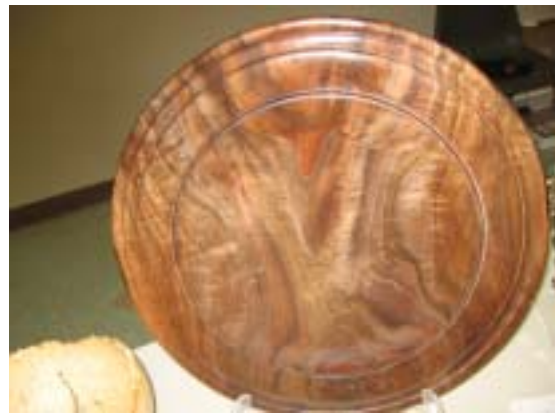
Phil Sargent's Claro Walnut platter.