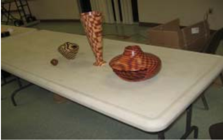
Examples of Malcolme's styles of segmentation.