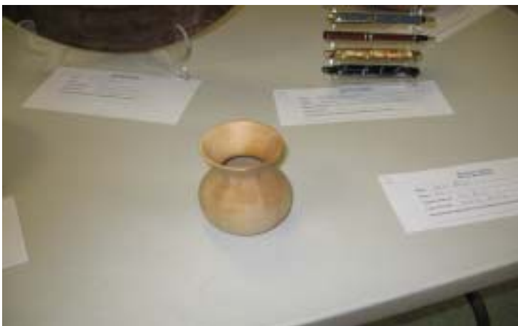
Dale Blue's orchard Pear vase