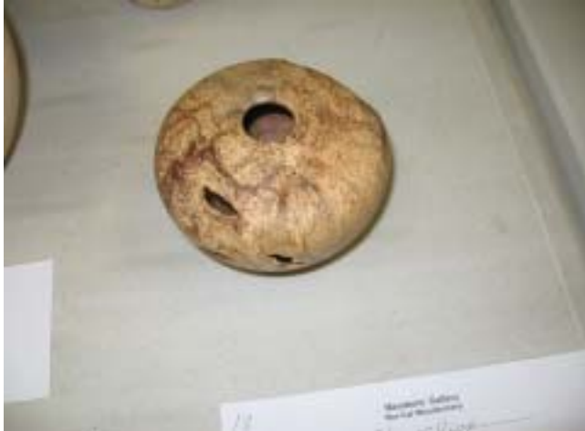
Bill Flewelling's hollow vessel (unidentified wood)