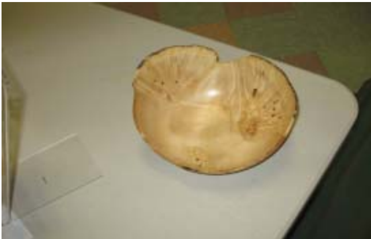
Dale Blue's Box Elder burl bowl