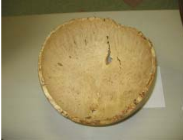
Bill Flewelling's natural edge bowl of Box Elder burl.