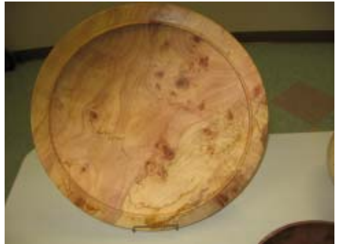
Kent Nelson's Maple platter