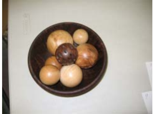
Ted Young's bowl of balls Various Walnut woods.