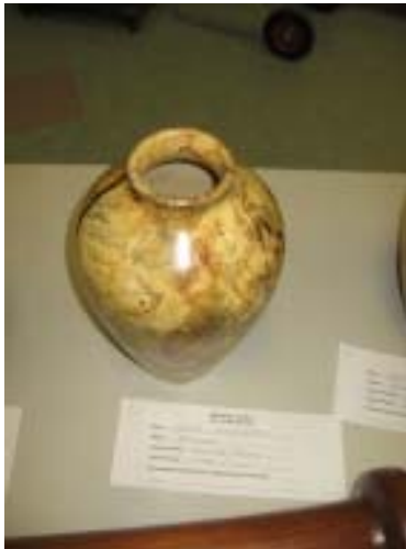
Herb Medsger's Modesto Ash vessel.