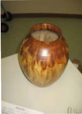
Herb Medsger's Chinese Tallow vessel.