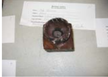
Bob Hosea's Claro Walnut vase (rice fields bog walnut from '99 floods)