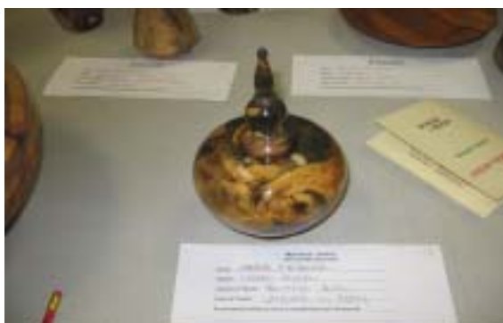
Herb Medsger's lidded vessel of Buckeye burl