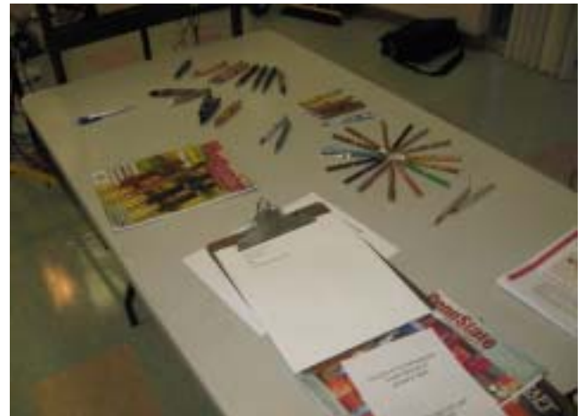
Just a few examples of Mike's more exotic pens