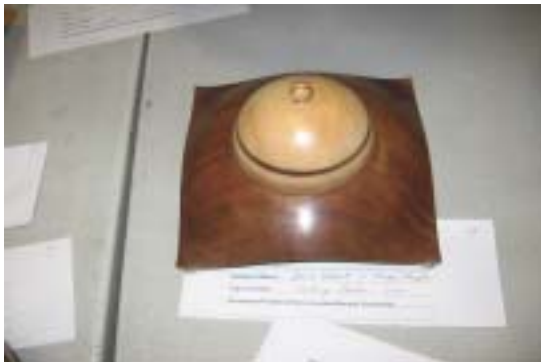
Corwin Jones' box of Black Walnut and Sugar Maple