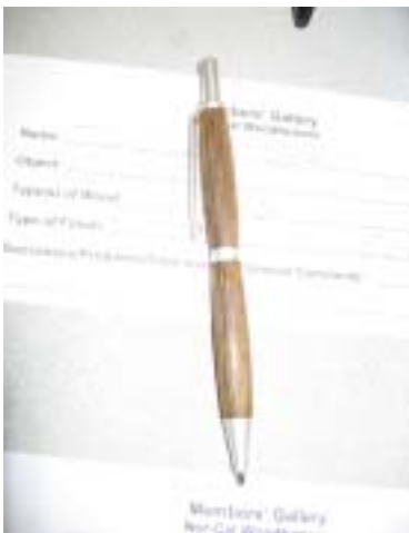
Tylers Hosea's cactus pencil