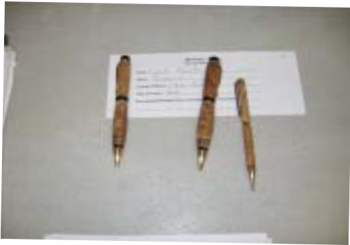
Carl Kent's Live Oak pens