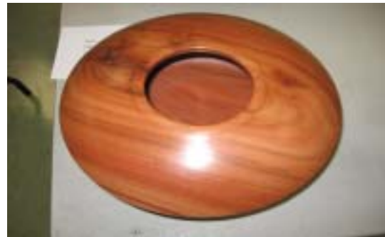
Vincent Cleek's hollow vessel