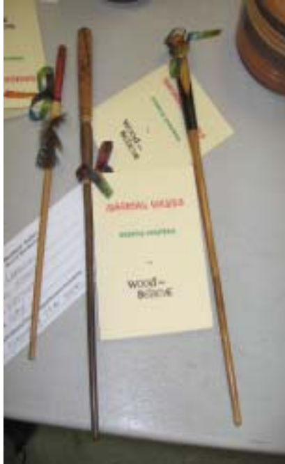
Mets Lerwill's magic wands of various woods