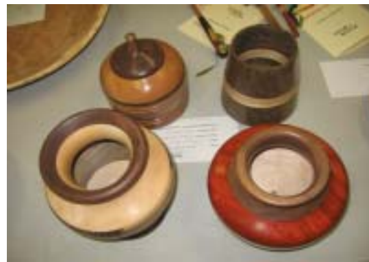
Jim Terrill's 3 vases and a lidded vessel Maple, Walnut, Hickory and Padouk