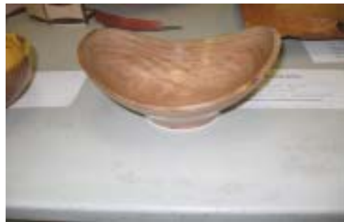
Ted Young's natural edged Melaleuca bowl