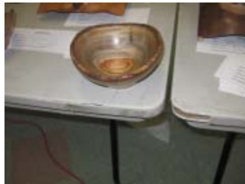
Ted Young's natural edged Camphor bowl