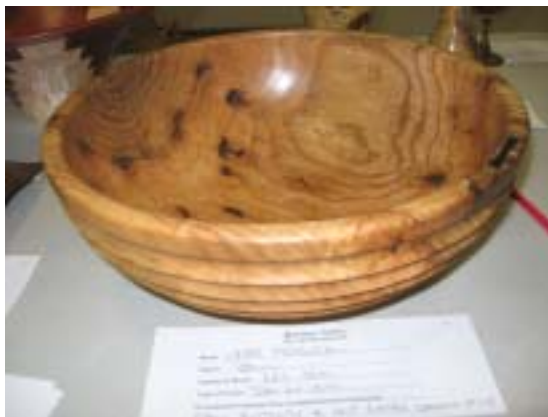
Herb Medsger's Red Oak bowl