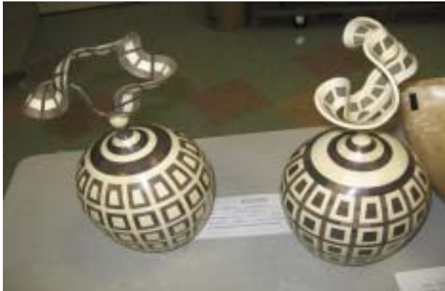
Malcolm Tibbetts' lidded vessels Blue Maple and Holly