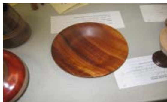
Russ Swenson's Koa plate