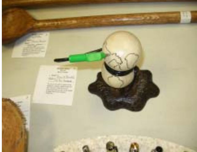
Rollie Bowns' "The Big Squeeze"