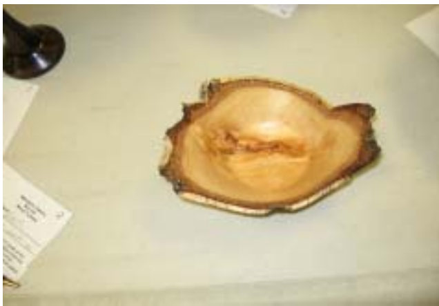
Phil Sargent's natural edge Birch bowl