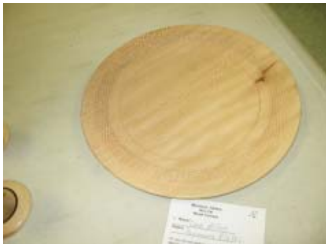
Dale Blue's Sycamore platter