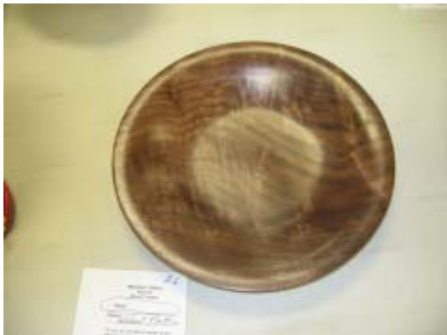
Phil Manning's bowl of (perhaps) Walnut wood