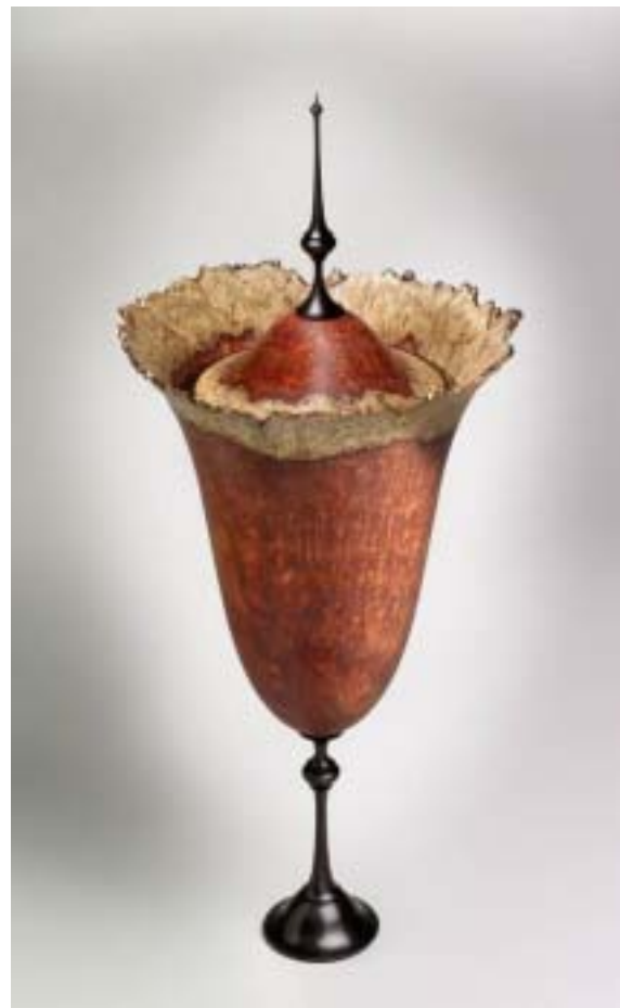
Cindy Drozda's lidded vessel with a 'trademark' finial.