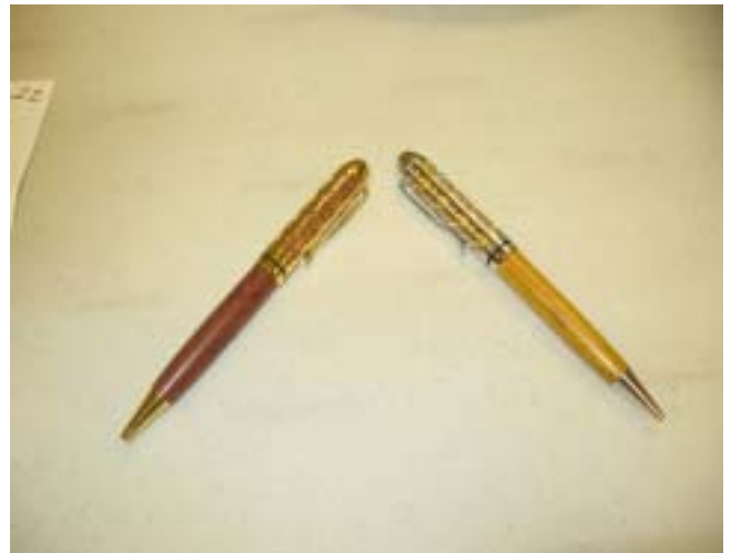
Two lovely pens by unknown turner