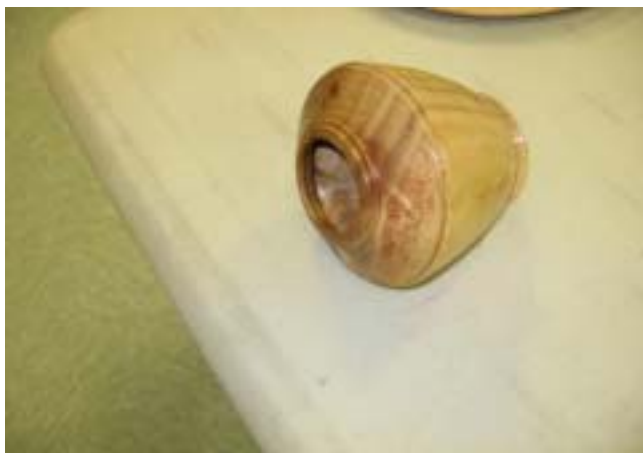
Corwin Jones' African Sumac vessel