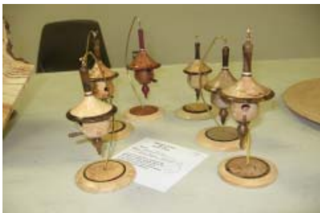
Dale Blue's six bird-house ornaments