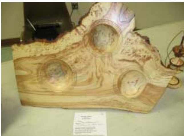
Bill Flewelling's Honey-locust multi-centered turning