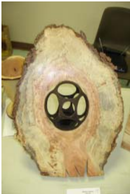
Bill Flewelling's Honey-locust turning with an internal turning