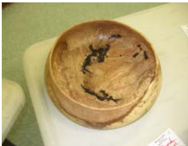
Kenn Womack's Oak burl bowl