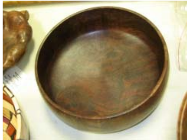
Bruce Friederich's Claro Walnut salad bowl