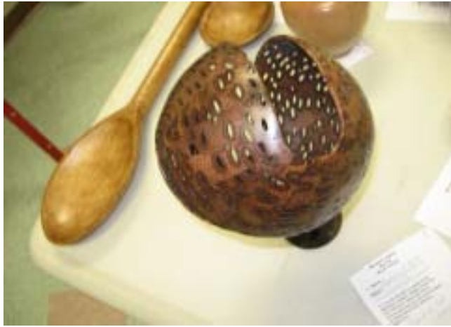
Malcolm Tibbetts' "Fortitude" of Banksia seed pod and Ebony