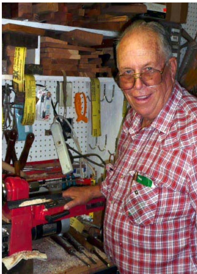
Examples of Irvin's work on page 5