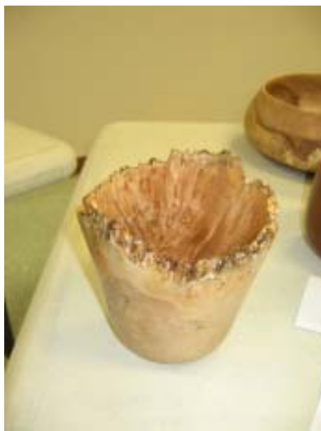
Kenn Womack's Natural-edged Maple Bowl