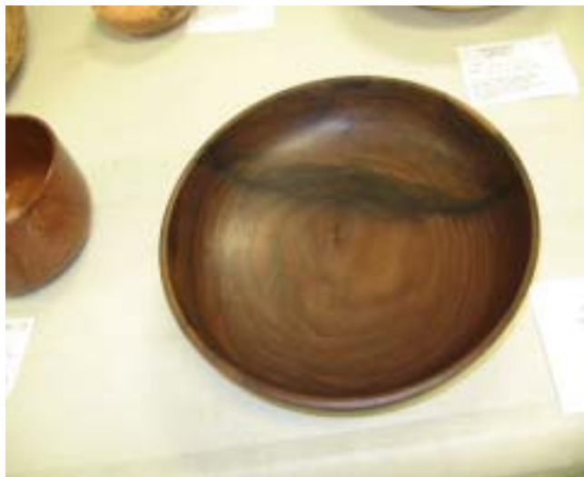
Tom Castaldo's Walnut bowl