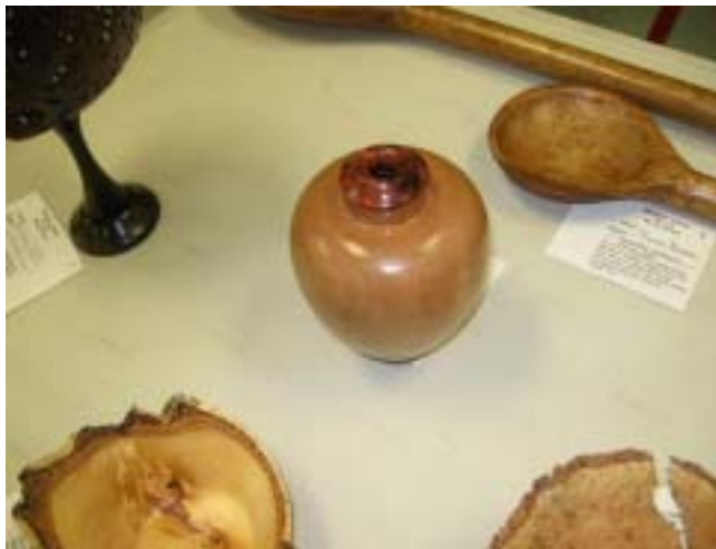
Phil Sargent's vase