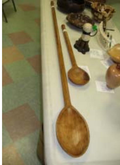
Rollie Bowns' White Oak wooden spoons