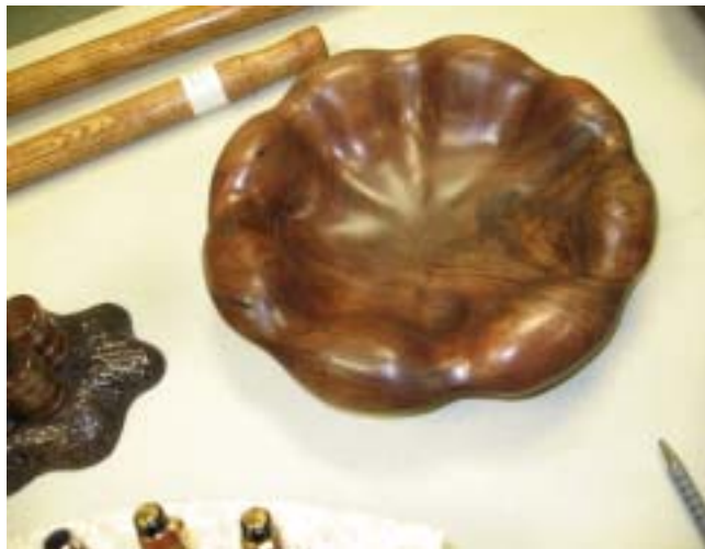
Rollie Bowns' carved Walnut bowl