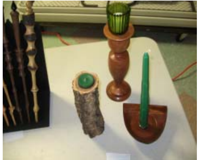
Three candle holders by Glenn Robison