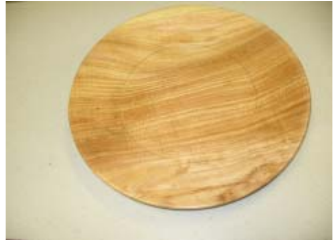
Dale Blue's Pear wood dish