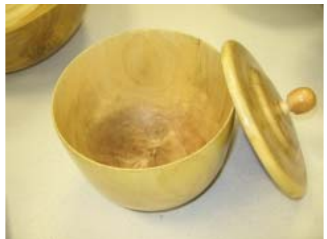
Herb Medsger's Chinese Tallow bowl with lid