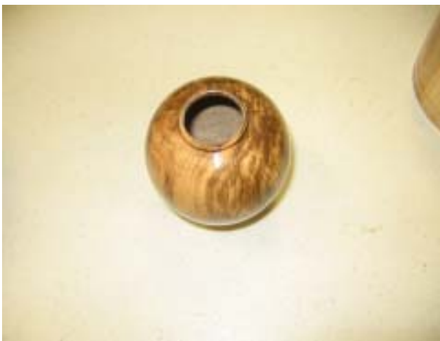
Herb Medsger's Persimmon vessel