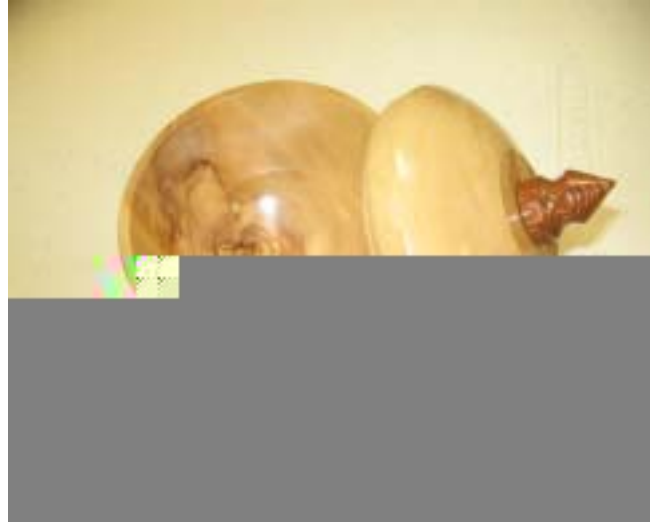
Dick Leytem's lidded bowl (wood not listed)