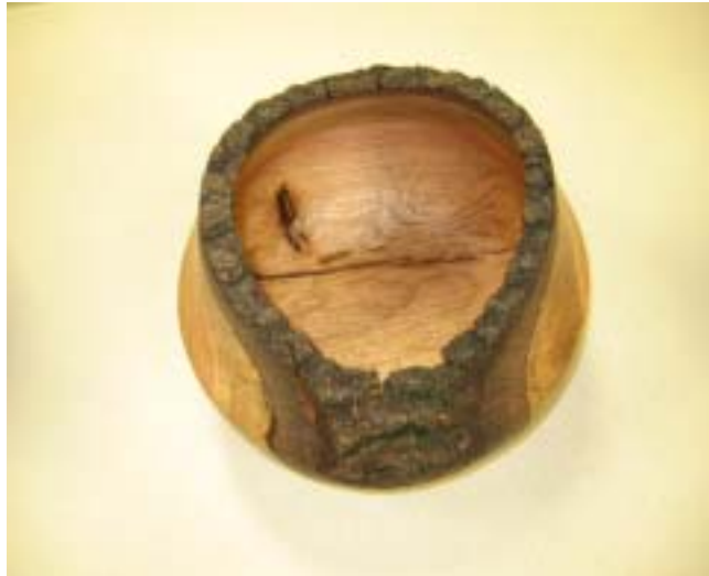
Jerry Hall's hollow form with natural edge (wood not listed)