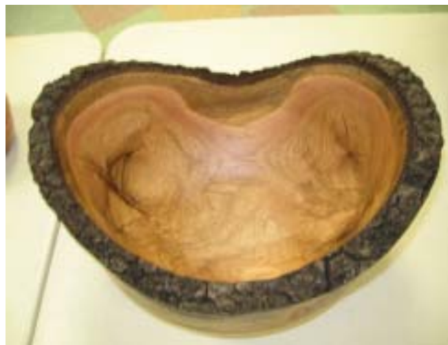
Jerry Hall's natural edged bowl (wood not listed)