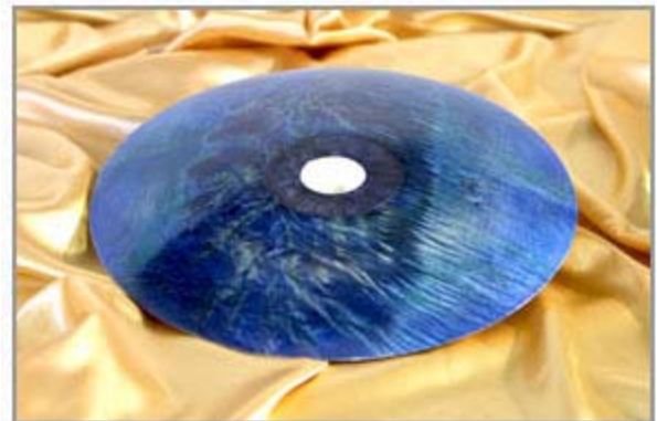
Some examples of Jimmy’s work.