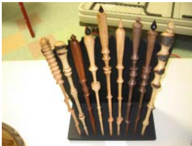
Jerry Hall's pointers (various unlisted woods)