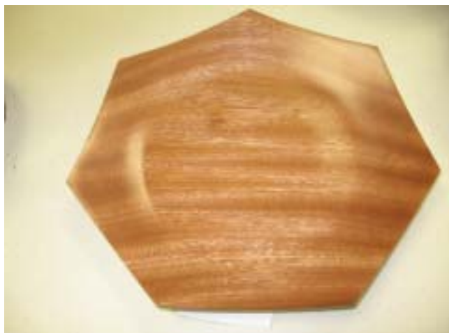
Dal Blue's Mahogany platter