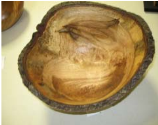
Jerry Hall's natural edged bowl (wood not listed)