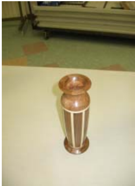
Bob Adam's vertical stave vase