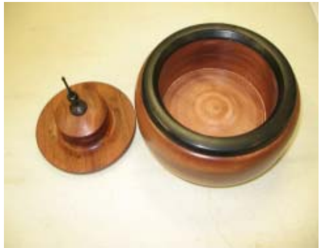
Rod Taylor's Walnut Lidded box