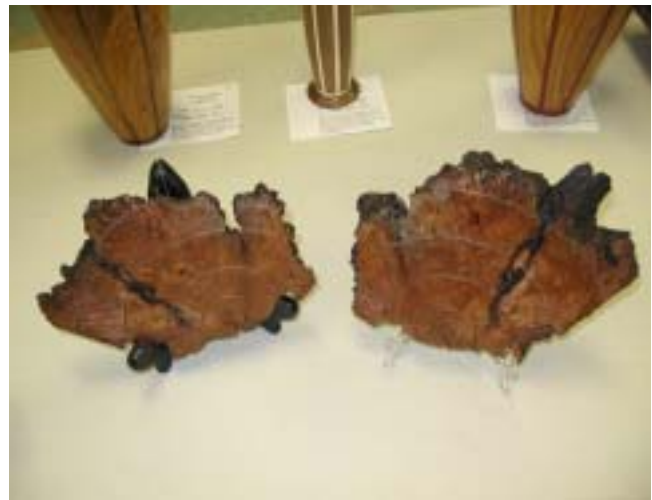
Tom Castaldo's Toyon wall hangings