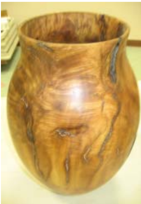
Herb Medsger's Chinese Tallow vessel