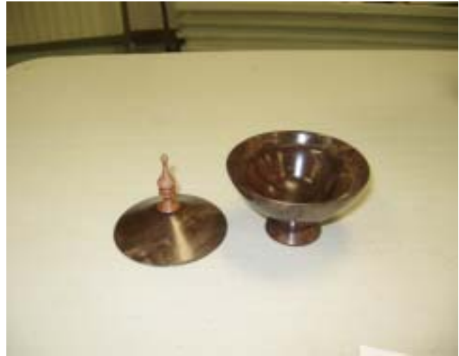
Phil Sargent's Walnut box