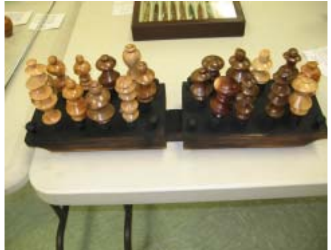
Jerry Hall's bottle stoppers