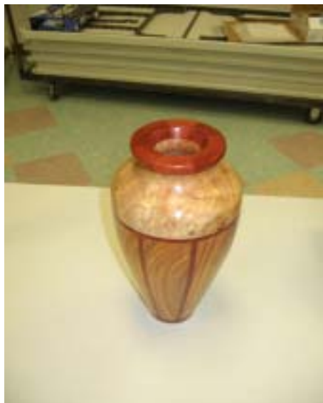
Bob Adam's vertical stave vase