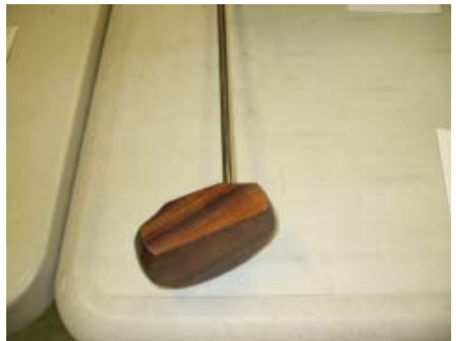
Herb Medsger's Putter