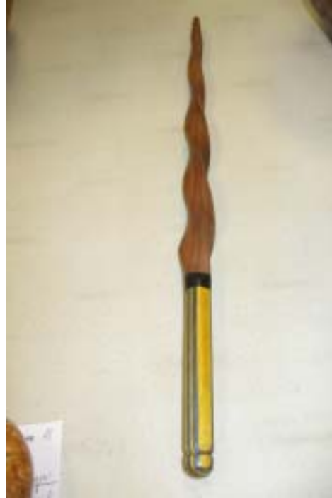
Mets Lerwil's twisted wand