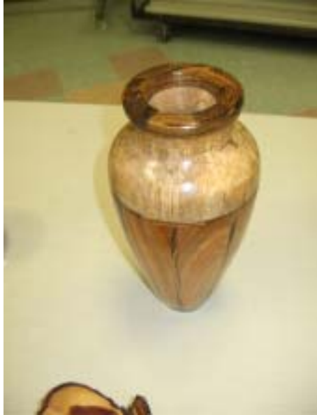
Bob Adam's vertical stave vase