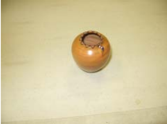
Herb Medsger's Cherry mini-vessel