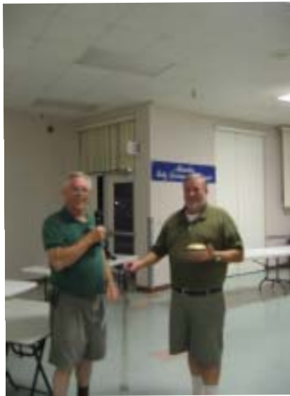
Mets Lerwil 3rd.place