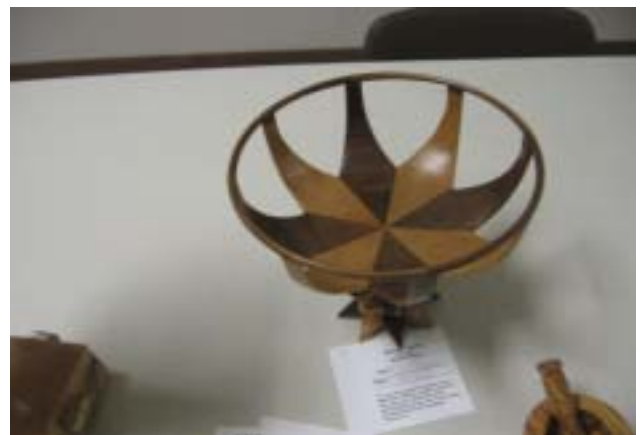
Dan Clark's inside-out bowl with 8 pieces