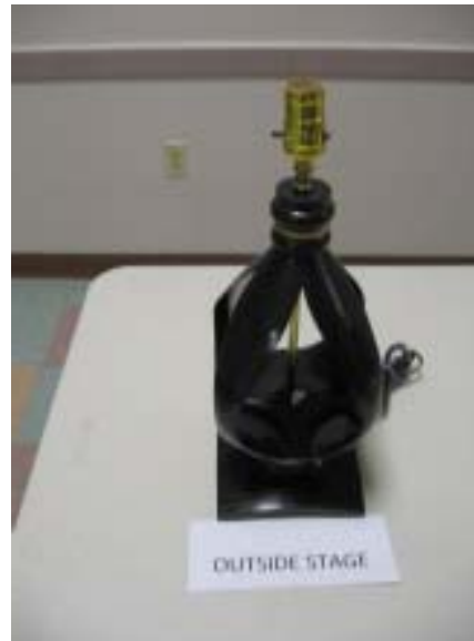
Dan Clark's inside-out lamp