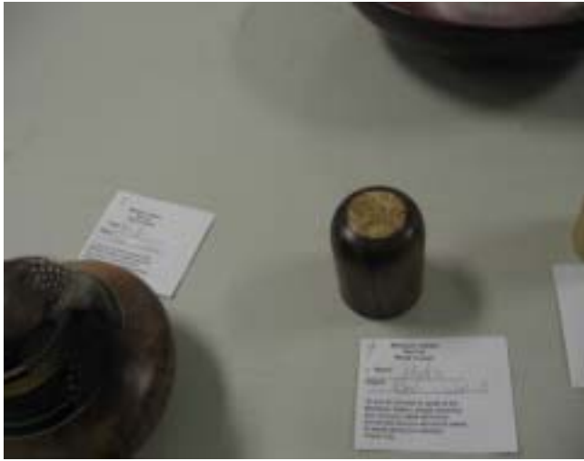
Mets Lerwil's Walnut box