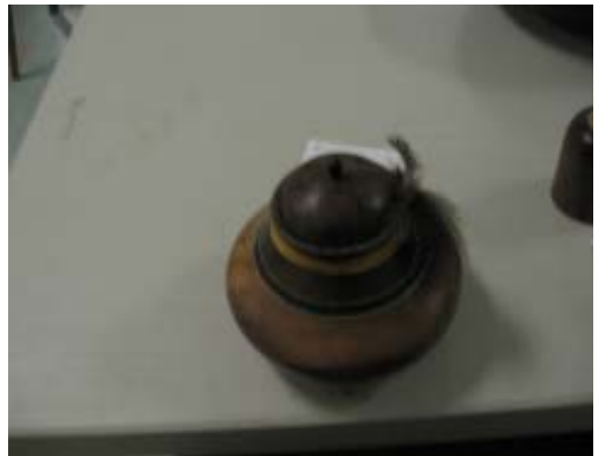
Mets Lerwil's Alder box