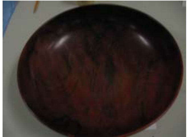
Herb Medsger's dye'd Walnut bowl