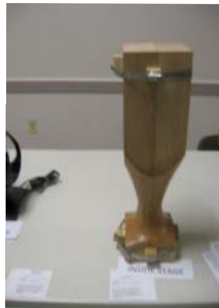
Dan Clark's illustrative stage of inside-out turning