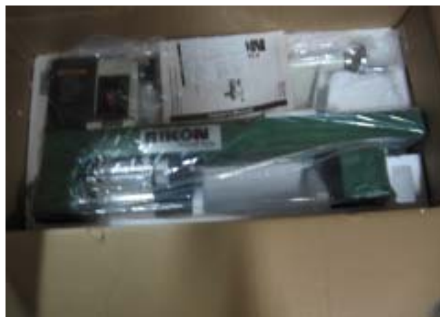
Rikon lathe... in, and (almost) out, of the box