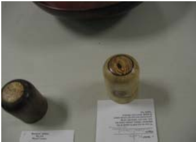
Mets Lerwil's Pistachio enclosed vessel