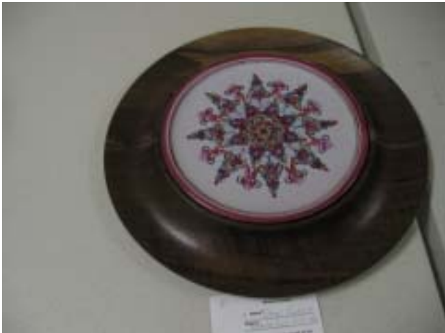
Dan Clark's cheese/dip platter