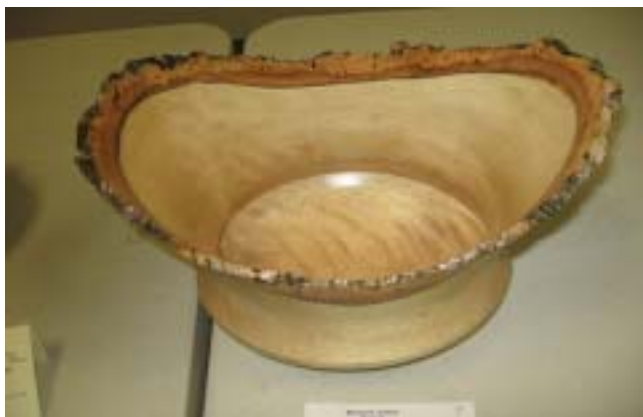
Corwin Jones' natural edged, flat bottomed (Cork Oak?) bowl