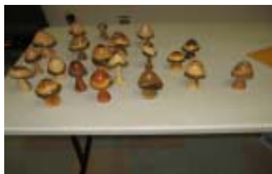
A sampling of Walt's work.