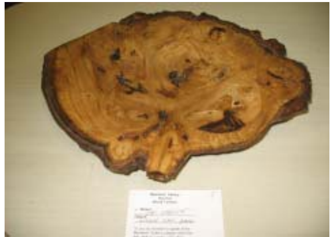
Phil Sargent's winged Oak bowl.