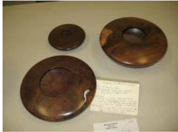
Corwin Jones' three narrow mouthed vessels of (Walnut?) wood. These were finished as examples of three different finishes.