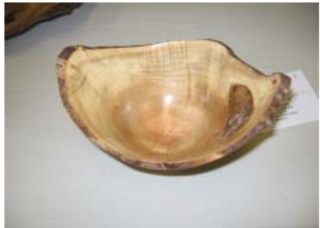
Phil Sargent's natural edged Ash bowl