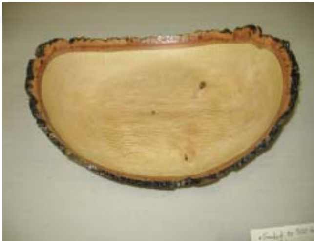
Corwin Jones' natural edged (Cork Oak?) bowl