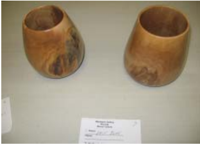
Dale Blue's two vessels of (unspecified) wood