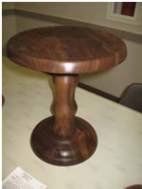
Dan Clark's Walnut plant stand.