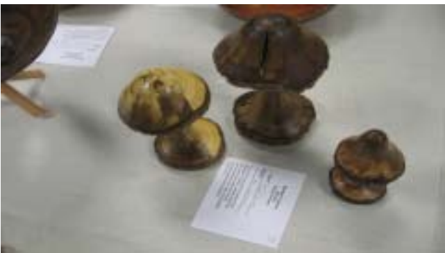
Ted Young's mushrooms