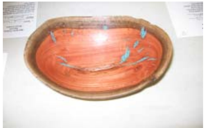
Ted Young's Eucalyptus and turquoise bowl