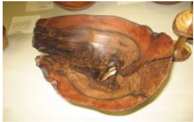
Ted Young's natural edged Walnut bowl