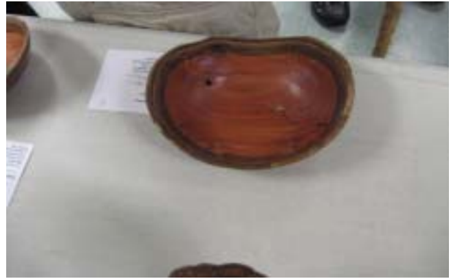
Ted Young's Eucalyptus vessel