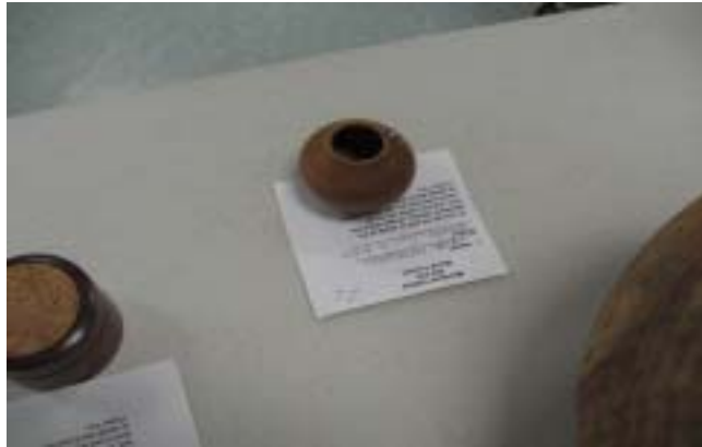
Herb Medsger's White Birch vessel