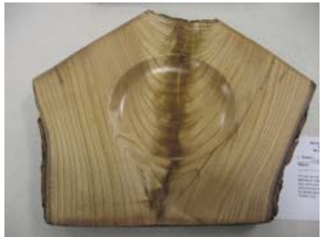
Dick Lambert's other irregular edged 'flat' bowl