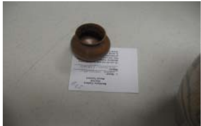
Herb Medsger's laced miniature