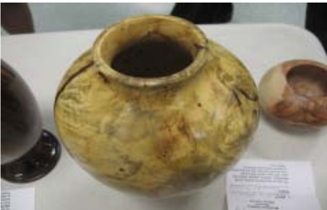
Herb Medsger's Buckeye burl hollow vessel