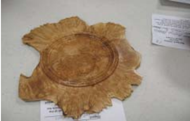
Phil Sargent's Big Leaf Maple burl plate