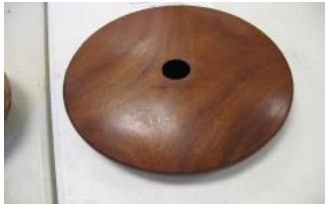
Corwin Jones' Walnut(?) hollow vessel