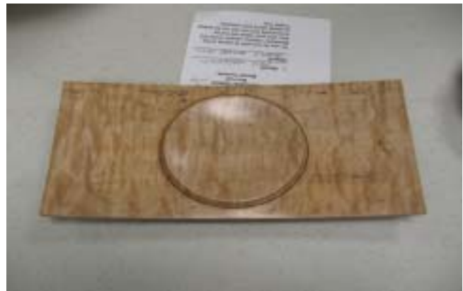
Phil Sargent's winged Maple bowl