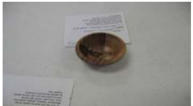
Corwin Jones' small African Sumac bowl