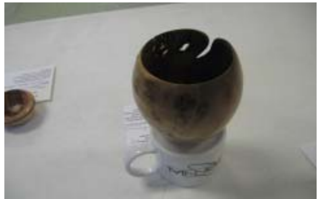
Corwin Jones' Pepperwood vessel