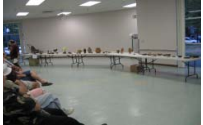
A well-filled Members' Gallery table