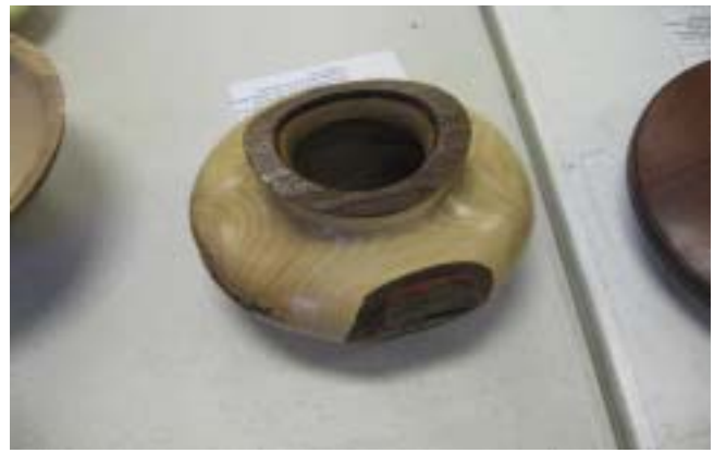
Corwin Jones' natural edged closed bowl