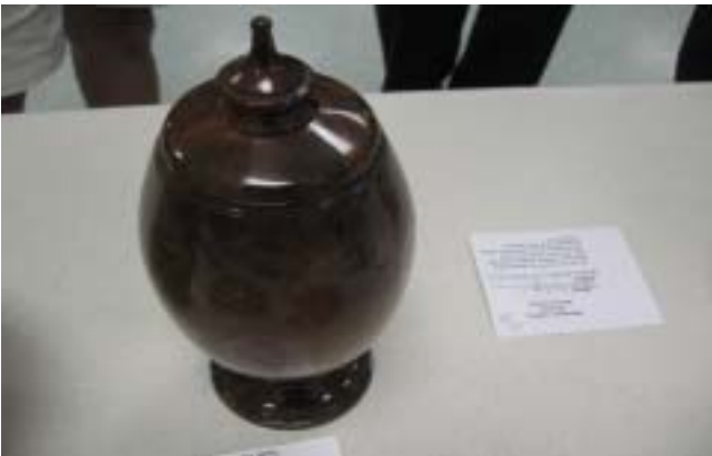
Herb Medsger's lidded vessel