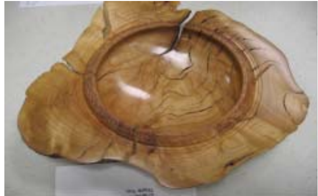
Phil Sargent's winged Yew bowl