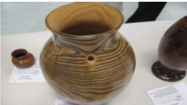
Herb Medsger tinted Ash vessel