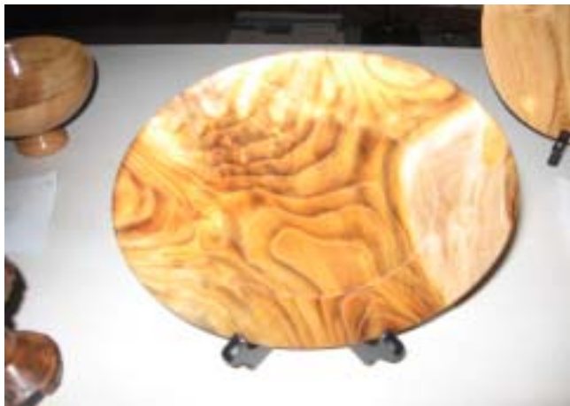
Dale Blue's Pecan plate