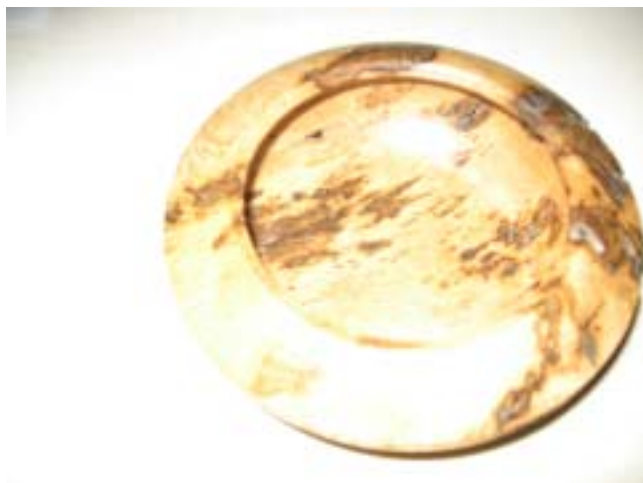
Phil Sargent's Black Oak bowl