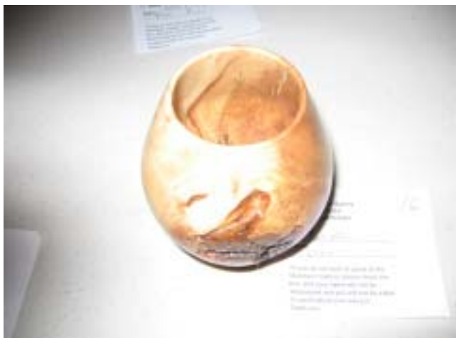
Dale Blue's vase