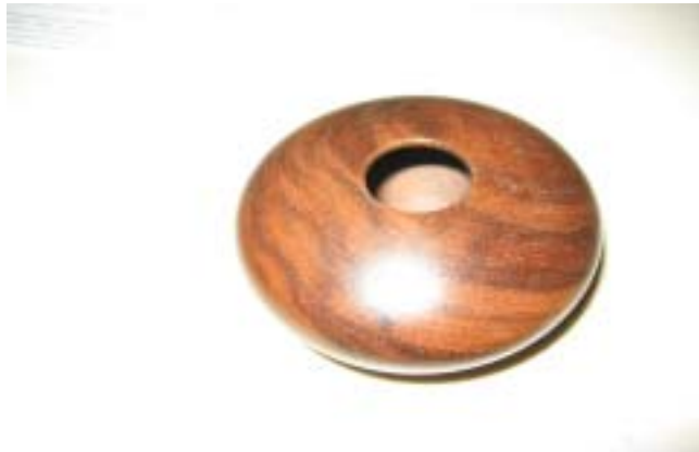
Jay Richens' Walnut vase