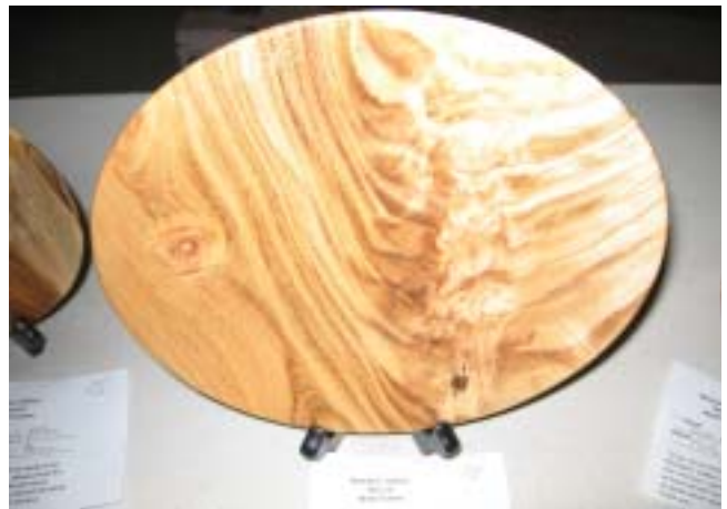
Dale Blue's plate