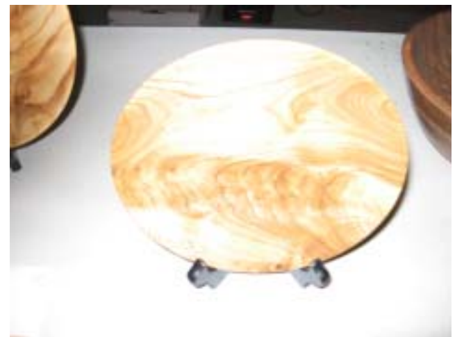
Dale Blue's Pecan plate