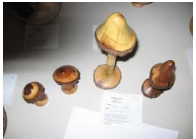
Ted Young's mushrooms