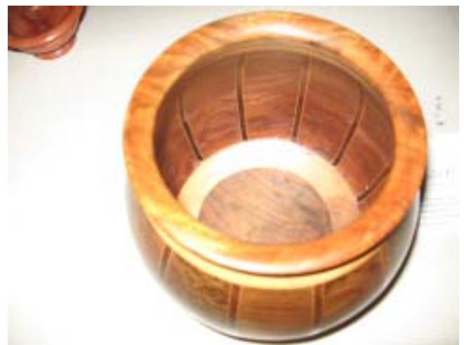
Ron Nagy's urn of Redwood, Maple and Walnut