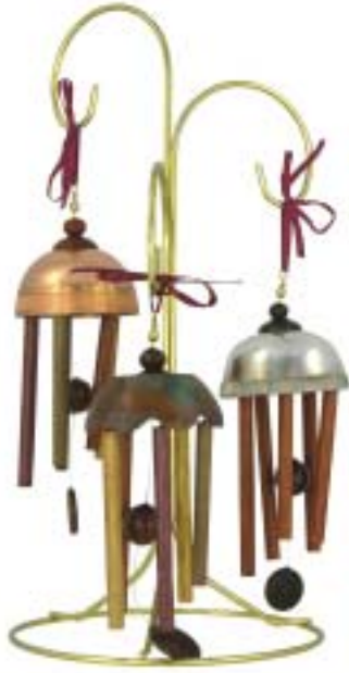
Tom Castaldo's copper and aluminum ornaments