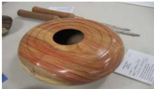
Corwin Jones' Carob closed vessel