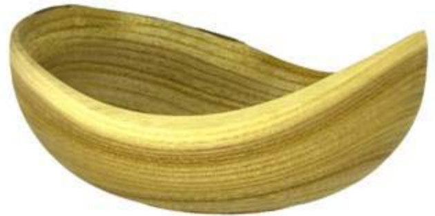
Mike Spanbauer's natural edged bowl