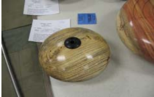
Corwin Jones' spalted Maple and Ebony vessel