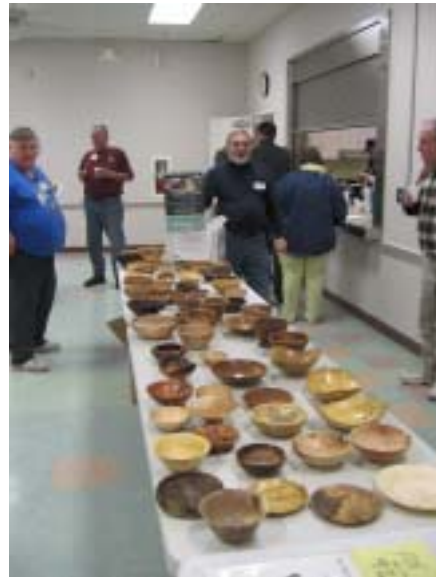
Empty Bowls. 94 bowls were collected at the January meeting