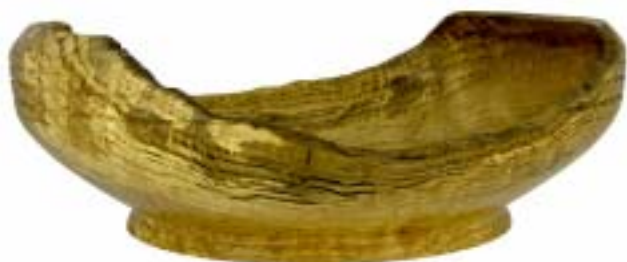
Phil Sargent's natural edged Live Oak bowl