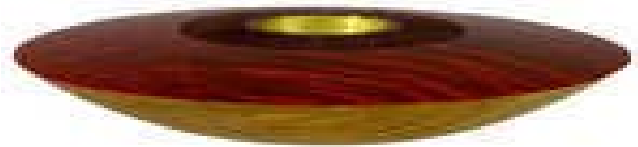
Jay Richens' dyed and carved Mable plate with gold-leaf center