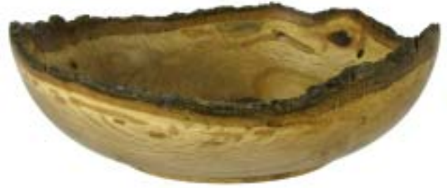
Craig Milliron's natural edged Oak bowl