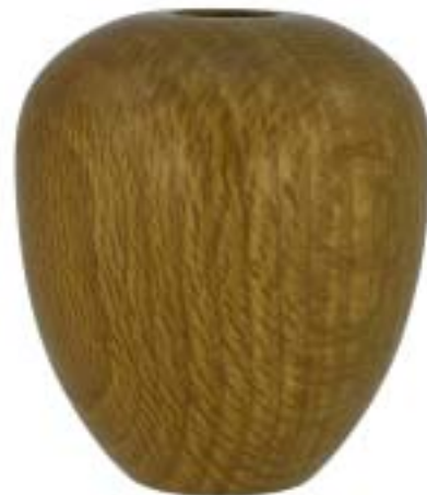
Dwight Rutherford's Cork Oak hollow form