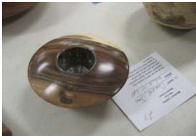
Corwin Jones' Walnut tea light