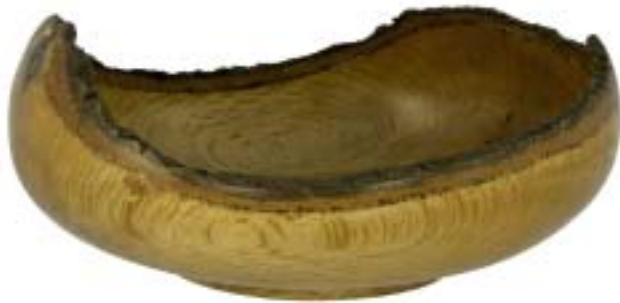
Craig Milliron's natural edged bowl