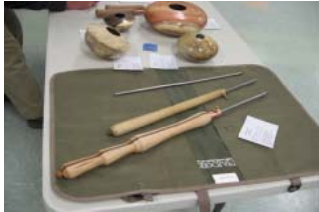
Corwin Jones' 3 turning tools