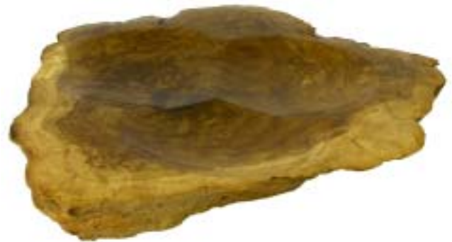
Phil Sargent's Blue Oak burl triple bowl