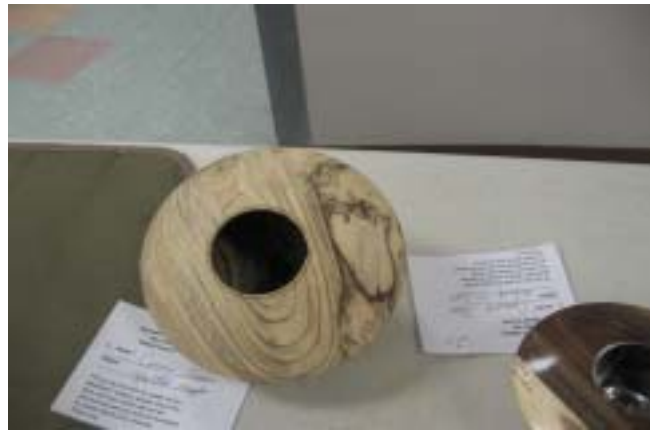
Corwin Jones' spalted Maple vessel (in progress)