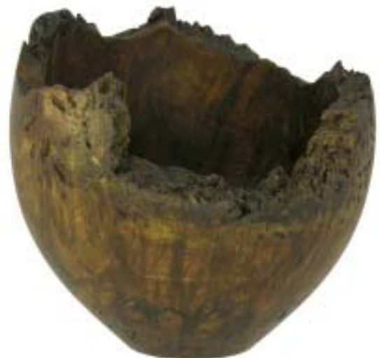
Jay Richens' natural edged Walnut bowl