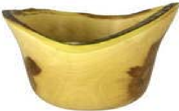
Tony white's Applewood natural edged bowl