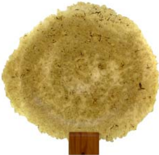
Phil sargent's Big Leaf Maple wall hanging