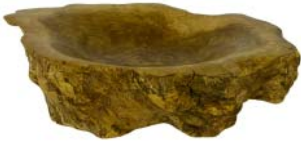
Phil Sargent's Blue Oak burl natural edged bowl