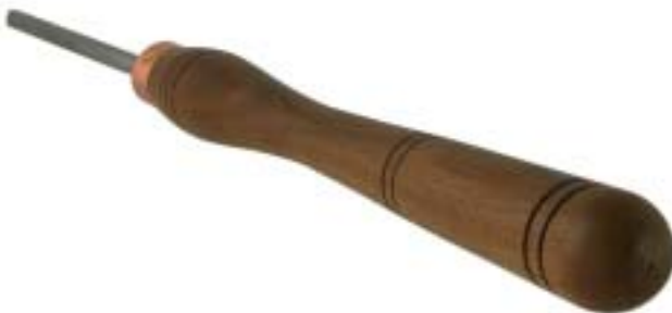
John Landis' Walnut (firewood) tool handle