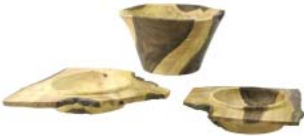
James Terrill's Walnut bowl and two Walnut winged bowls