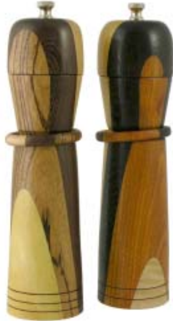
Bob McClurg's salt & pepper grinders of exotic woods.