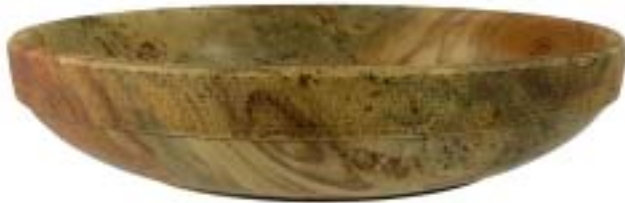
Phil Sargent's Honey Locust/Mistletoe bowl with textured rim