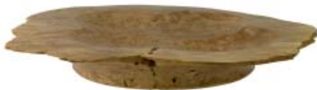
Phil Sargent's Maple burl quadruple bowl