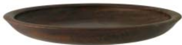
Don Hendricks' Walnut platter