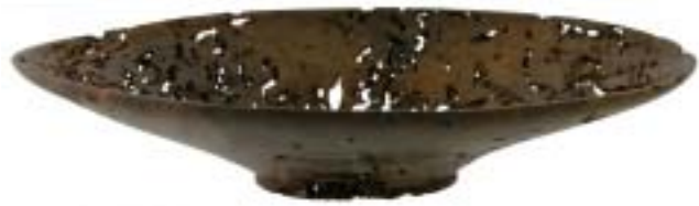
Phil Sargent's wormy Walnut bowl