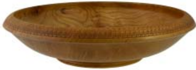
Phil Sargent's Cedar bread bowl