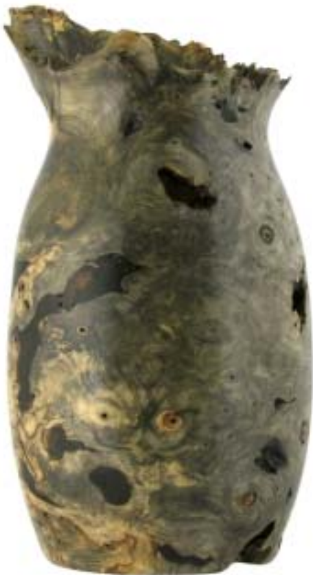
Tom Castaldo's natural edged Buckeye burl vase