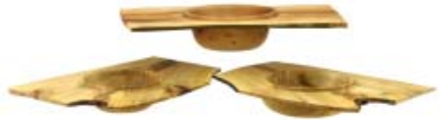
Chris Fuch's winged, natural edged, crotch figure bowls (Looks like Olive wood... Ed.)