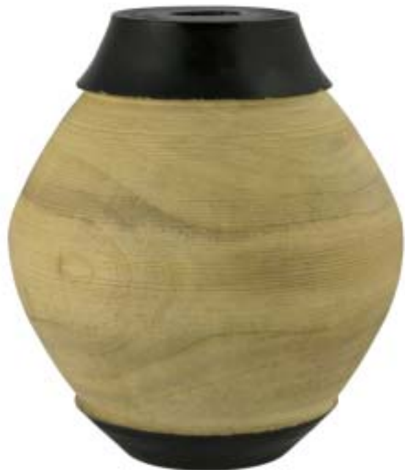
(Information not available)