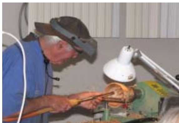
“Don't go through the bottom!!!”