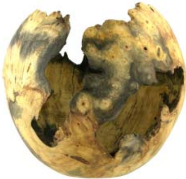
Dwight Rutherford and Kent Nelson's natural edged Buckeye burl vessel