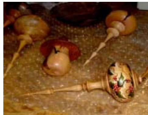
Some of Bob's ornaments