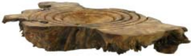
Phil Sargent's natural edged Black Cottonwood burl bowl