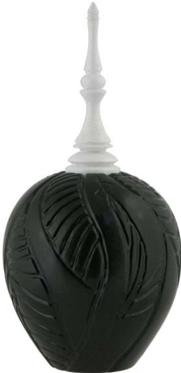
(information not available)