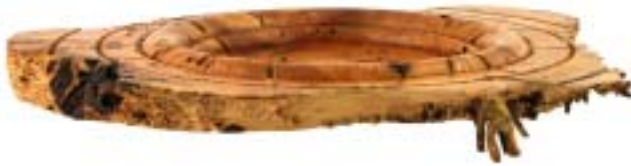
Phil Sargent's winged Madrone burl bowl (with worm holes)