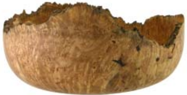
Dwight Swaback's natural edged Maple burl bowl