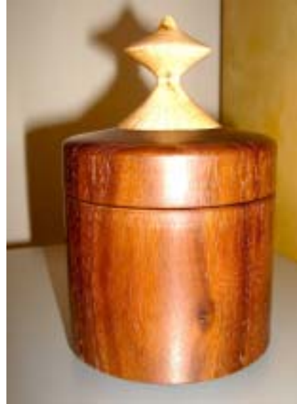
Bill's Walnut box with white finial.