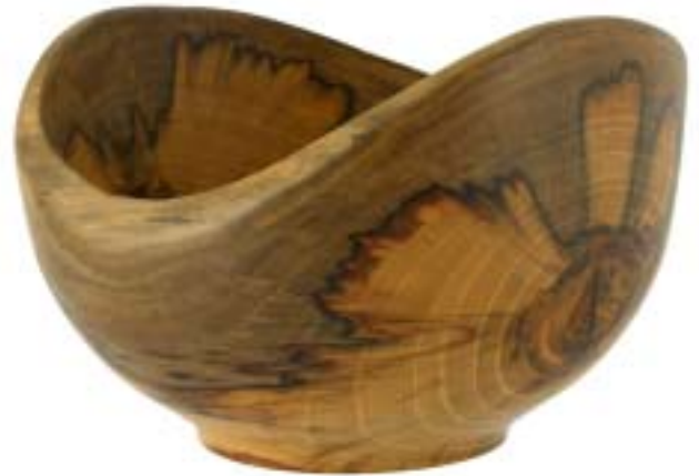
Dwight Swaback's natural edged Pistachio bowl