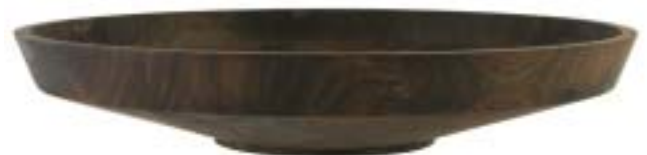
Don Ranstrom's shallow Walnut bowl