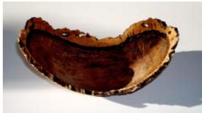
Bill's natural edged bowl