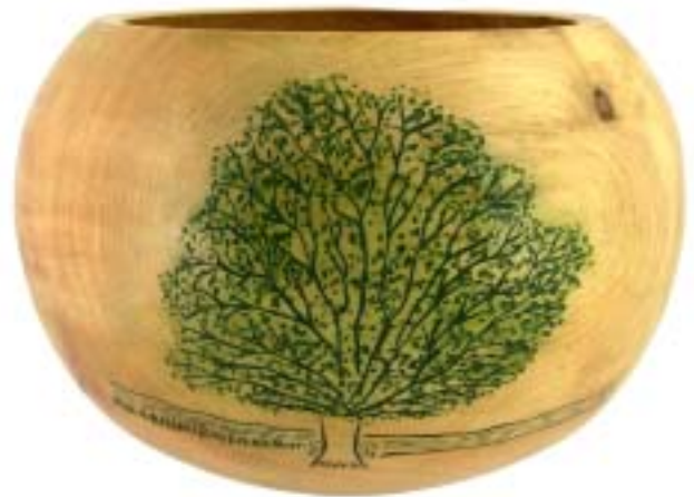
Tom Castaldo's Bristlecone Pine bowl with carving