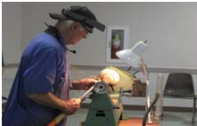
Getting the shape right

The turnings have been removed from the library, and will be returned to their owners at the July meeting. Don't forget to pick them up.