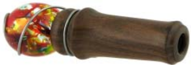
Craig Milliron's (Black Walnut?) turning