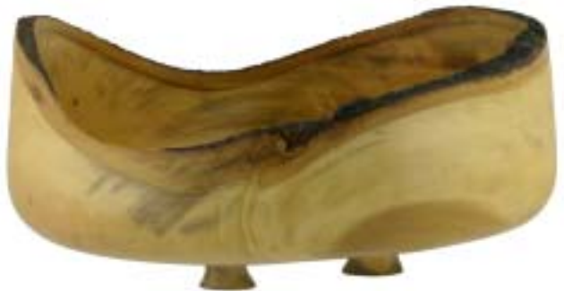
Bob McClurg's natural edged Magnolia bowl with carved feet