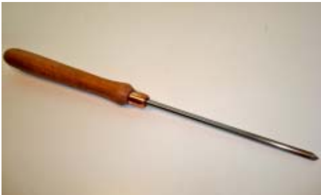
Bill Wisheropp's self-made 3/8" turning tool with self-made Madrone handle