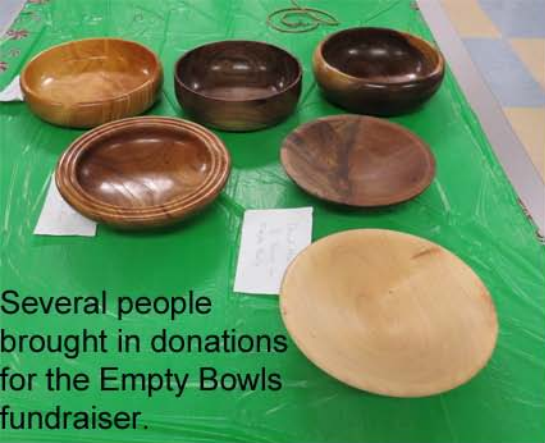
Several people brought in donations for the Empty Bowls fundraiser.